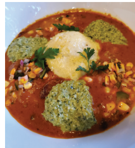
Shrimp and Grits at Cress

For the discerning diner, Cress is at the top of locals' and visitors' cuisine list. Winning the 22nd Annual Orlando Sentinel Foodie Award in 2020 is no small feat — and this tiny restaurant always has a long reservation list for dining indoors or at one of their streetside outdoor tables. Their menu, a wonderful easy-to-pilot one page, represents their commitment to sourcing and