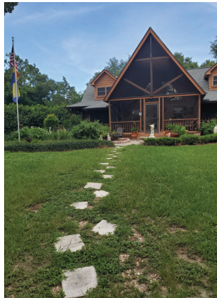
Cabin on the Lake, Lake Helen

with a long view of the train tracks with daily scheduled trains that really add to the ambience. It's a perfectly balanced menu of steaks, seafood, casual contemporary fare, burgers and the best "sweet onion ring loaf" this side of the tracks!