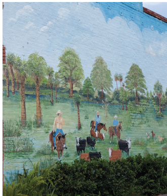
An Old Florida mural in DeLand

At every street’s turn, notice the amazing murals that demand your attention.