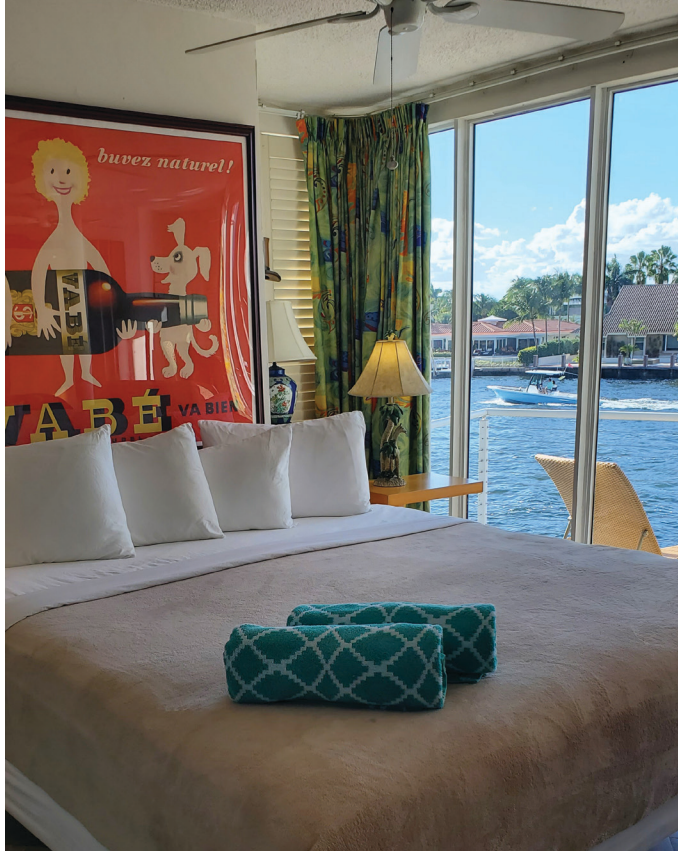
Suite with distinctive décor