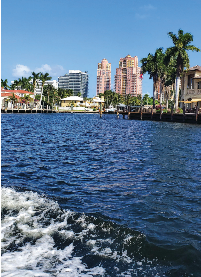
Exterior photo from water taxi of the entire panorama of Manhattan Tower.