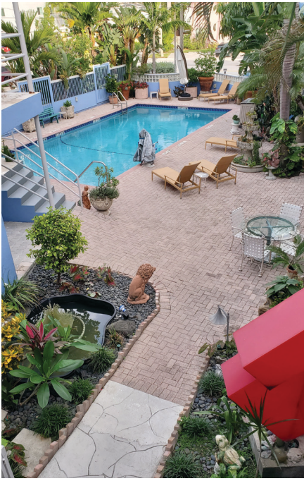
A place to relax by the pool.